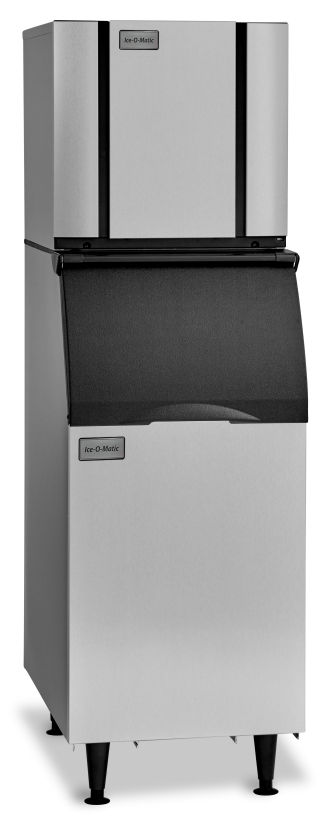
CIMO320 ON B42