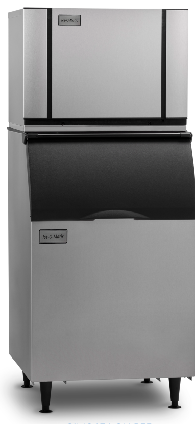
CIMO636 ON B55