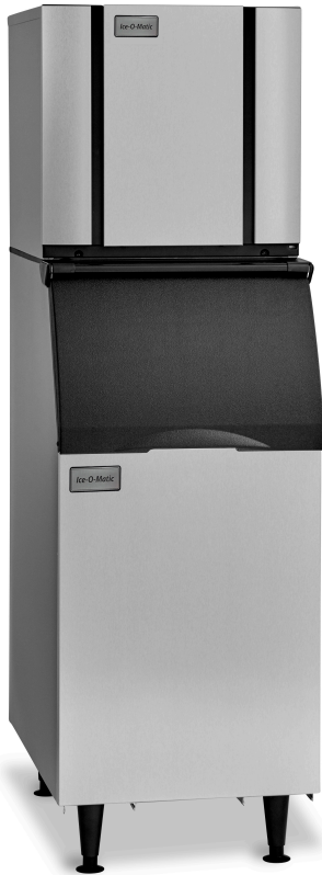
CIM1126 ON B42